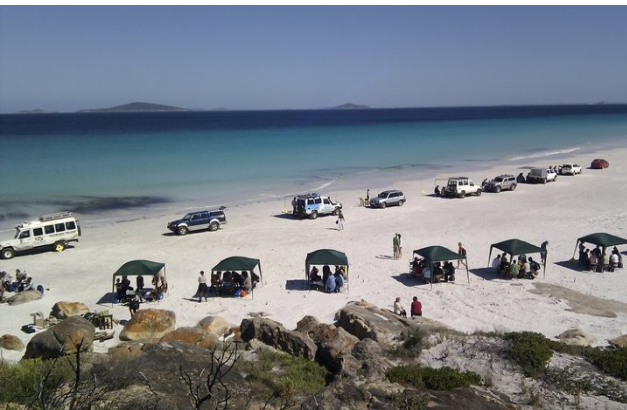
Workshopping on the beach at Cape Le Grand