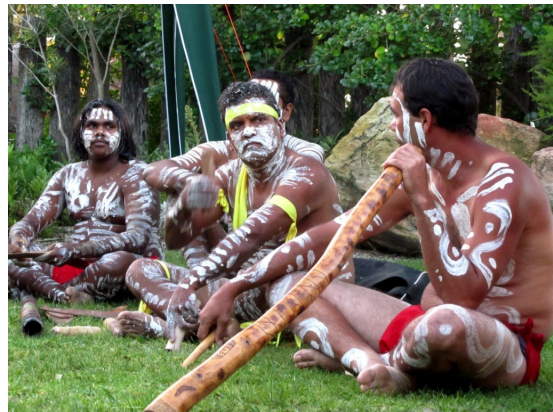
Dancers entertaining agents from Meiers