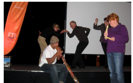
WA on Stage—Entertainment Highlights