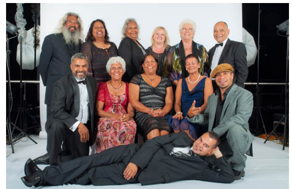
WAITOC Board and Management at Awards

WAITOC Members again featured in a range of a range of categories at the WA Tourism Awards held at Burswood, Perth. Among the 2010 award finalists were Eco Beach Wilderness Retreat, Home Valley Station, Uptuyu Adventures, Karijini Eco Retreat & Kepa Kurl finalists.