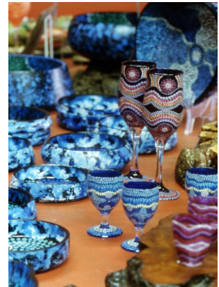
Maalinup Aboriginal Gallery

The venue for the event is the Old Midland Courthouse (cnr Helena St and Old Great Northern Highway)