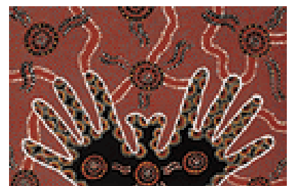
Australian Indigenous Tourism Conference 20–23 September 2011

The intent of the Conference is to assist and promote the Indigenous tourism business and industry sector as well as provide a comprehensive overview of the tourism industry. The Conference aims to bring people from around Australia and overseas that are involved with the Indigenous tourism landscape. The theme encourages delegates to talk business and inter-